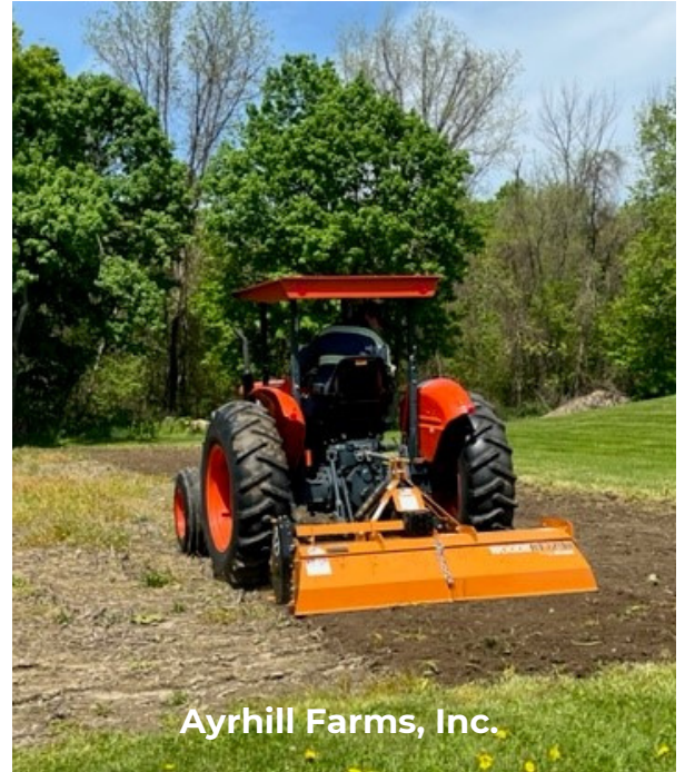
Ayrhill Farms, Inc.

"Without the award," they wrote, "this project could not have come now." Musante Farm finally took a project off the "to do" list, installing water lines and frost-free hydrants. "Between the expense and the arduous task of installation, it kept getting pushed to the back burner." Today the easy access to water greatly improves the efficiency of countless farm chores such as watering the chicken flock and washing the beekeeping and honey processing equipment.